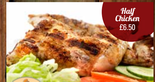
Half Chicken £6.50